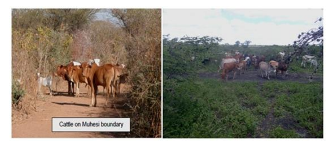
Fig. 2. Pastoralist with cattle in muhesi game reserve

*Results were based on multiple response (cases=359)