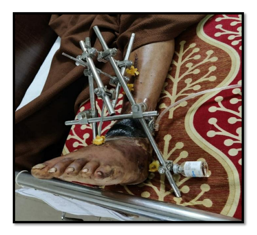
Fig. 4. Post-operative clinical presentation of the ankle joint by using delta fixator