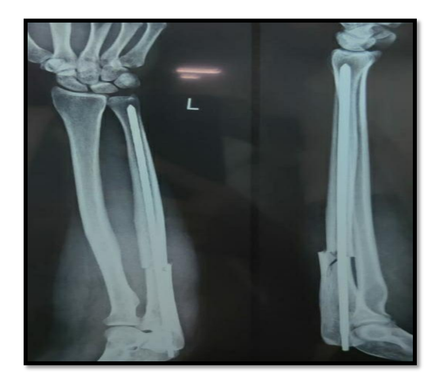
Fig. 6. Post-operative x-ray of Open reduction Internal fixation for ulna shaft fracture