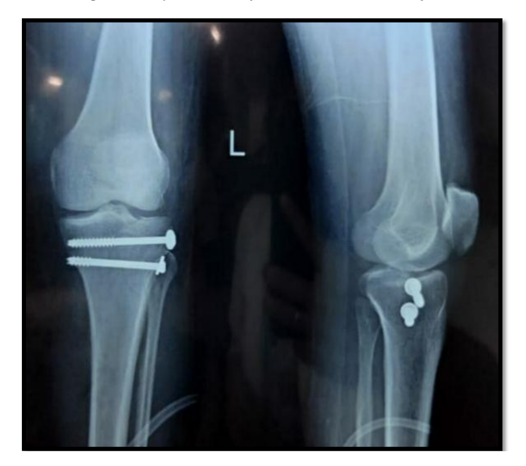
Fig. 3. Post-operative X-Ray of tibial condyle where the screw was inserted from lateral to medial