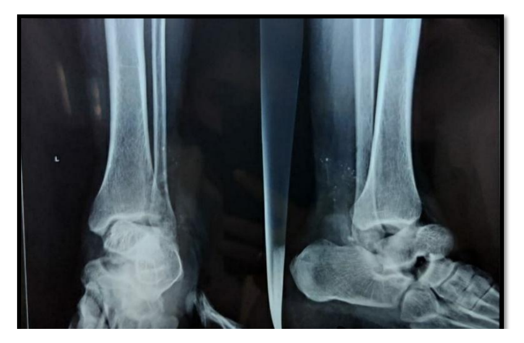
Fig. 1. Pre-operative X-Ray of Compound grade 3B Ankle joint dislocation

The patient signed a written consent form. Physical examination and treatments were explained to the patient. On general examination, the patient appeared to be awake, well-oriented in terms of time, location, and person, and cooperative. The patient was hemodynamically stable, afebrile, and had a blood pressure of 129/76 mm Hg, a pulse rate of 74 beats per minute, and a respiratory rate of 19 breaths per minute. There were no signs of cyanosis, icterus, clubbing, or edema in the patient. In a supine posture, the patient was examined. The patient's left leg was gently raised on a pillow during the examination, and an external Delta fixator was attached to the ankle with VAC. Joints in the knees and hips are in a neutral posture. Near the ankle and the tibial tuberosity, there are scars and abrasions. On palpation temperature was normal. The swelling was visible throughout the knee and ankle. Tenderness of grade 2 was found on bony landmarks below the knee. On both limbs, range of motion and muscular strength were measured and compared. All sensations and reflexes were intact on neurological evaluation. There was no difference in limb length. X-rays are taken before and after surgery, as well as clinical pictures are shown in Figs. 1, 2, 3, 4, 5, 6.