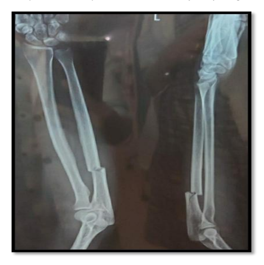
Fig. 5. Pre-operative X-Ray of proximal 1/3 shaft of ulna fracture left side

Fig. 4. Post-operative clinical presentation of the ankle joint by using delta fixator