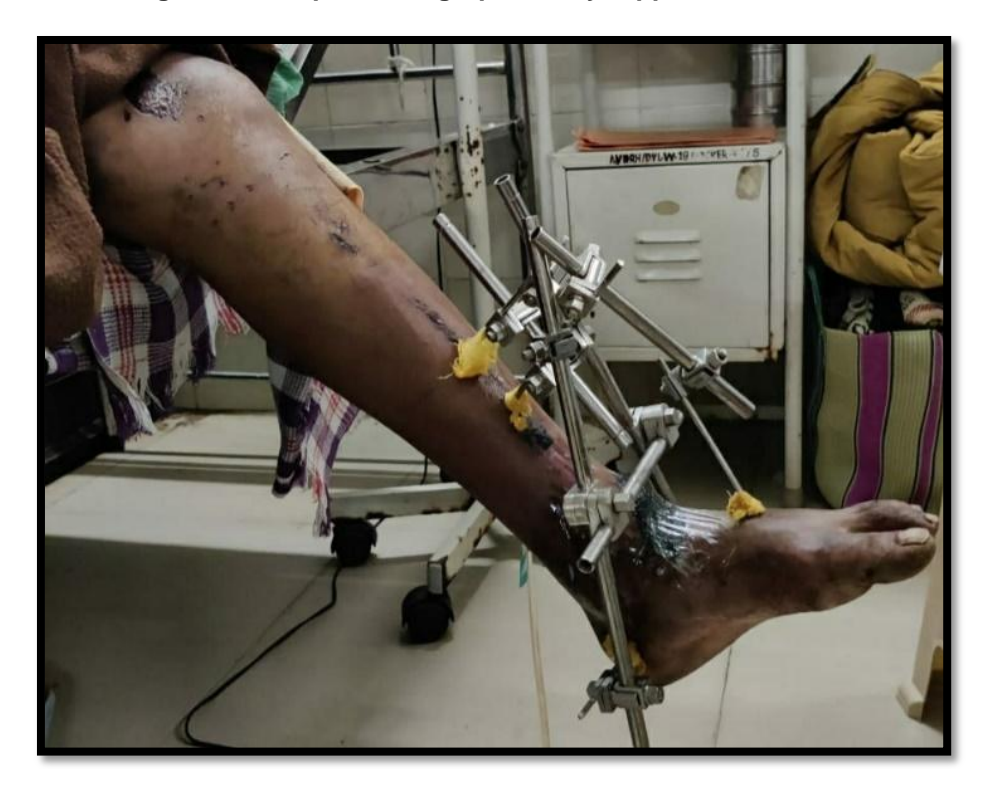
Fig. 8. Patient performing active lower limb movement