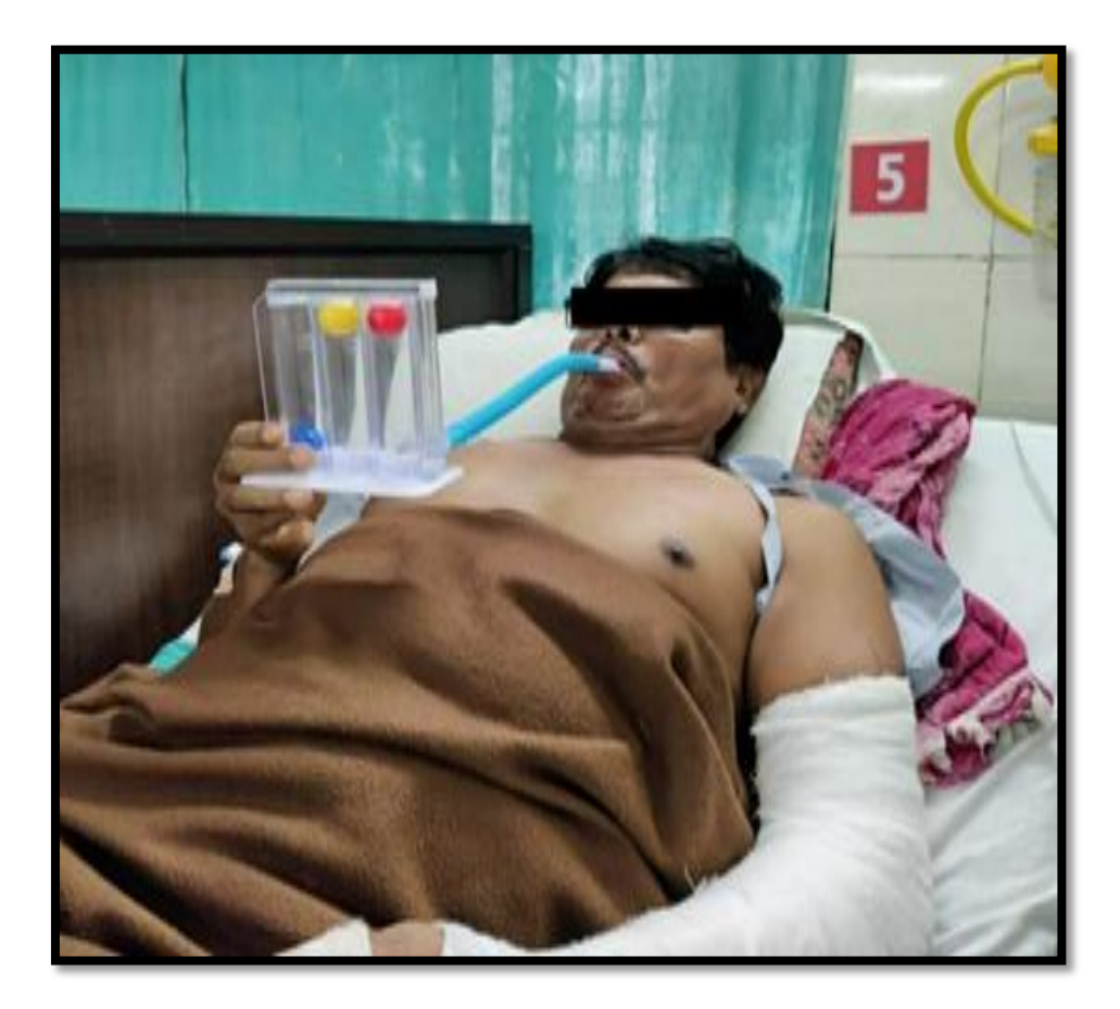
Fig. 7. Patient performing Spirometry, Upper limb in a cast