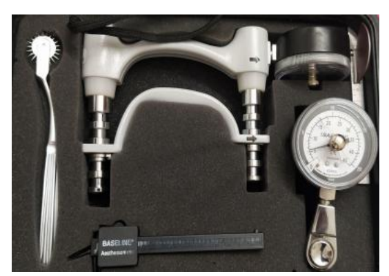
Fig. 1. Hand grip dynamometer

Sample was calculated using an Open Epi, Version 3 using the mean difference from the parent article [4]. The calculated sample size of the study will be 196, under criteria 49 for vertical, 49 for horizontal, and 98 for the average growth pattern. By comparing the value, we can determine whether the data are appropriately matched to female and male norms.