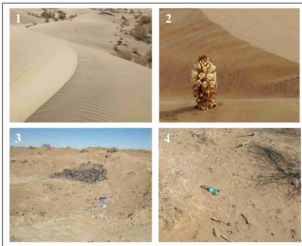
Figure 2. Insecticide in desert by tourists

The magical attraction of the Mesr desert is disturbed by insects. This desert has many visitors and they have to use insecticides to be protected from the native insects (Figure 2). The study run on this region revealed the amount of the empty can or plastic insecticides containers. Through amore in depth study the sand color change became obvious. Six sand samples are collected from the study area and analyzed.