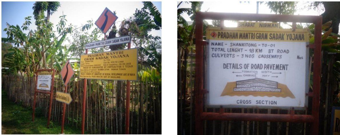
Fig. 2. Sign board indicating the implementation of PMGSY in the block and details of road pavement