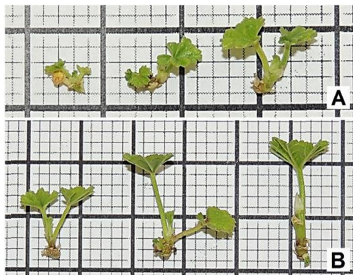
Figure 2. Axillary buds of Malva sylvestris . Small (<10mm) (A) and large, (> 10mm) (B), used as explants in the in vitro introduction of mallow ( Malva sylvestris )

Note. Smaller and larger squares correspond to 2 and 10 mm, respectively.