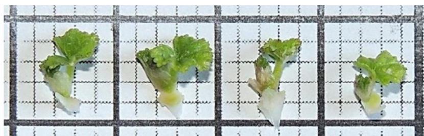
Figure 1. Axillary buds of Malva sylvestris used as explants in the in vitro introduction in Murashige and Skoog medium

Axial buds, containing 6 to 8 mm and 2 or 3 leaves (Figure 1), were used as explants in the in vitro introduction. The experiment was conducted in a completely randomized design in a 2 × 5 factorial arrangement, with the following factors: absence of IAA and IAA 0.5 mg L -1 combined with five (5) levels of BAP concentration. BAP concentrations were 0; 0.5; 1.0; 1.5 and 2.0 mg L -1 present in complete MS medium (10 mL tube -1 ), totaling 10 treatments, with 15 replicates in each treatment. The replicates consisted of one (1) explant.