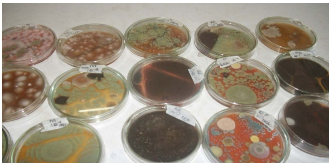
Fig. 3. Growth of some moulds from cereals and grains bought from the Local markets on DRBC and MEA incubated at 31\pm 2^{\circ}\text{C} after seven (7) da y

© 2017 Minamor and Appiagye; This is an Open Access article distributed under the terms of the Creative Commons Attribution License ( http://creativecommons.org/licenses/by/4.0 ), which permits unrestricted use, distribution, and reproduction in any medium, provided the original work is properly cited.