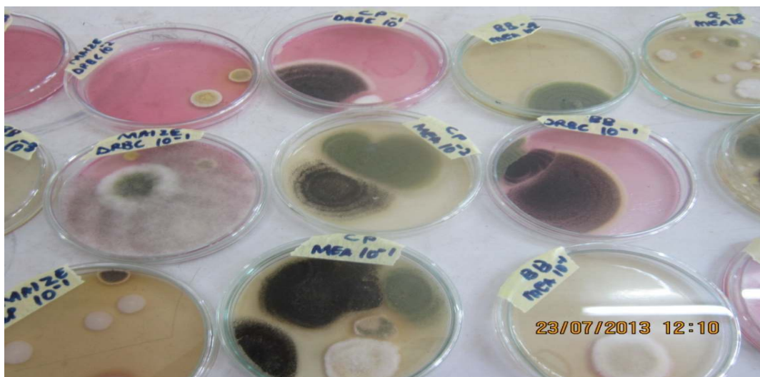
Fig. 2. Growth of some moulds from cereals and grains bought from the supermarkets on DRBC and MEA incubated at 31\pm 2^{\circ}\text{C} after seven (7) da y