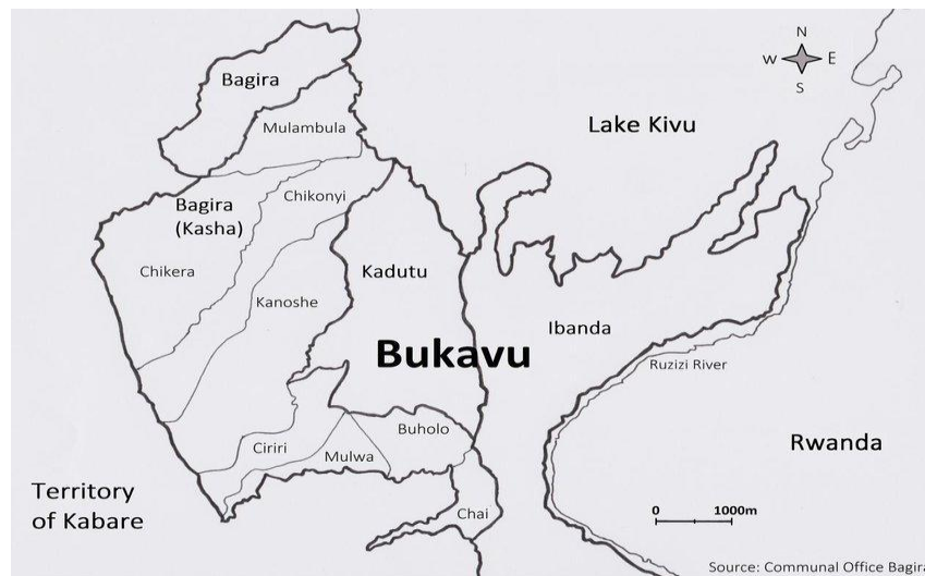
Fig. 1. Map of Bukavu city showing three administrative communes: Ibanda, Kadutu and Bagira (adapted from van Overbeek et al. [20])

The sociodemographic characteristics of dispensers were also recorded. The features of pharmaceutical interventions taken into account were the antibiotic dispensing pattern (with or without prescription), substitution or not substitution of antibiotics prescribed.