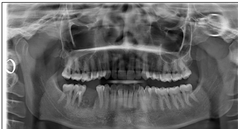
Fig. 2. Pre extraction orthopantomogram