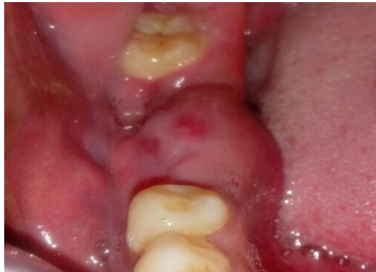
Fig. 1. Intra-oral swelling