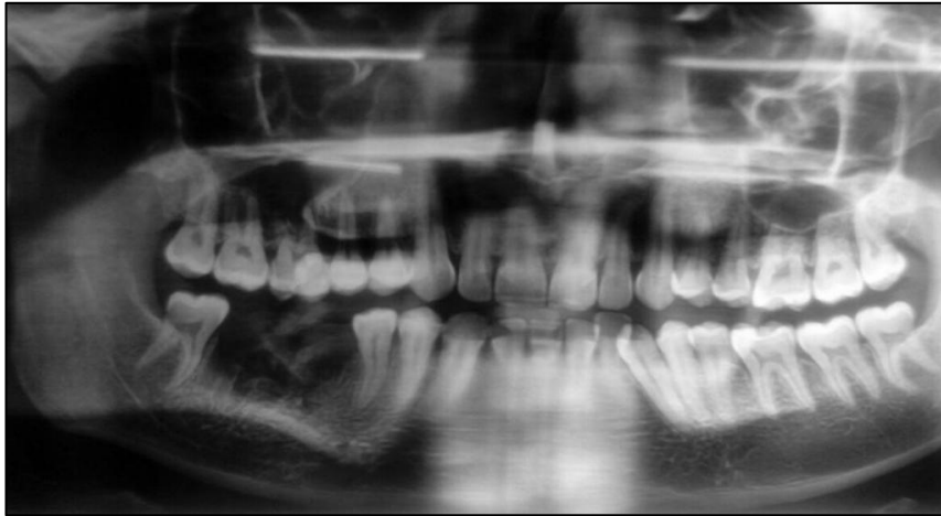
Fig. 4. OPG Post extraction