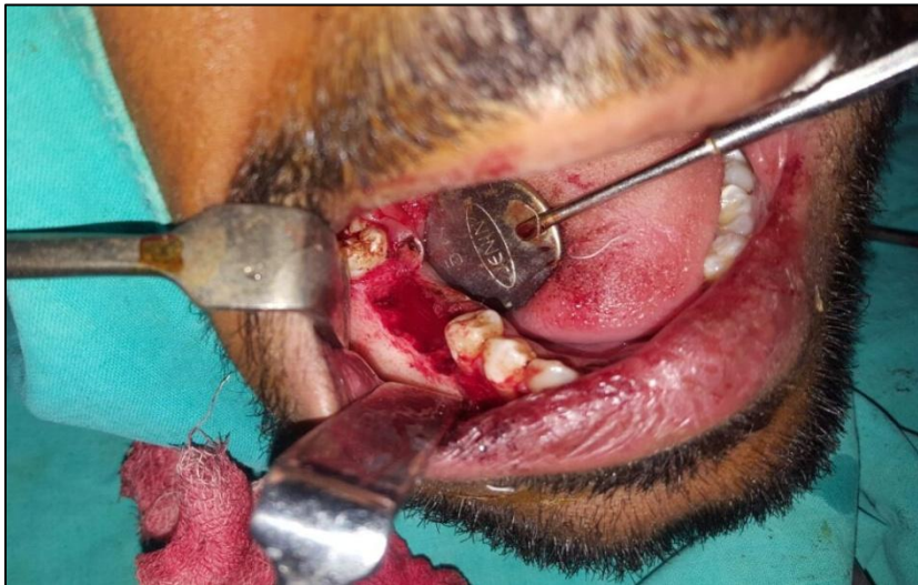
Fig. 5. Intra operative picture