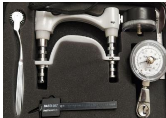
Fig. 1. Hand grip dynamometer

Sample was calculated using an Open Epi, Version 3 using the mean difference from the parent article [4]. The calculated sample size of the study will be 196, under criteria 49 for vertical, 49 for horizontal, and 98 for the average growth pattern. By comparing the value, we can determine whether the data are appropriately matched to female and male norms.